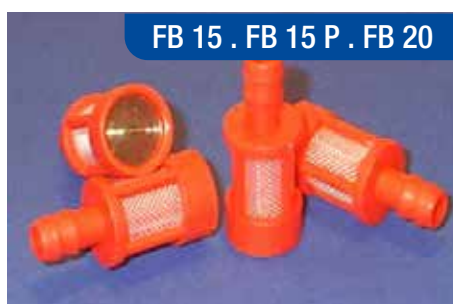
FB 15 . FB 15 P . FB 20